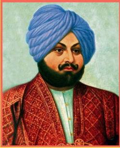
Dyal Singh Majithia (1848-1898)